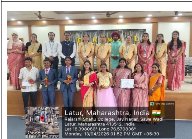
Glimpses of the Programme