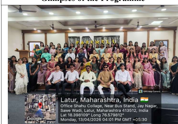
Faculty Members with outgoing Batch