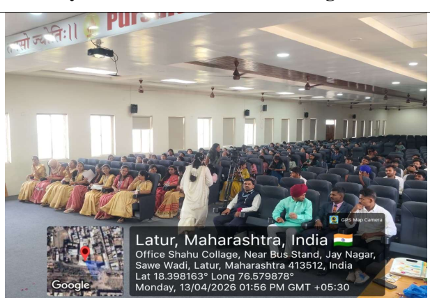
Attendees of the Programme

D) Link of Video of the programme if any