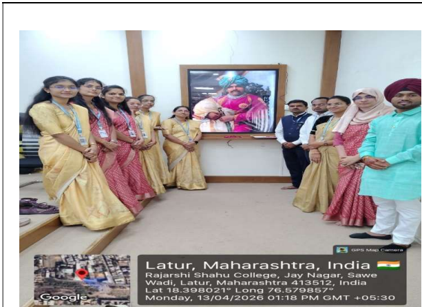
Lamp Lighting by Faculty Members