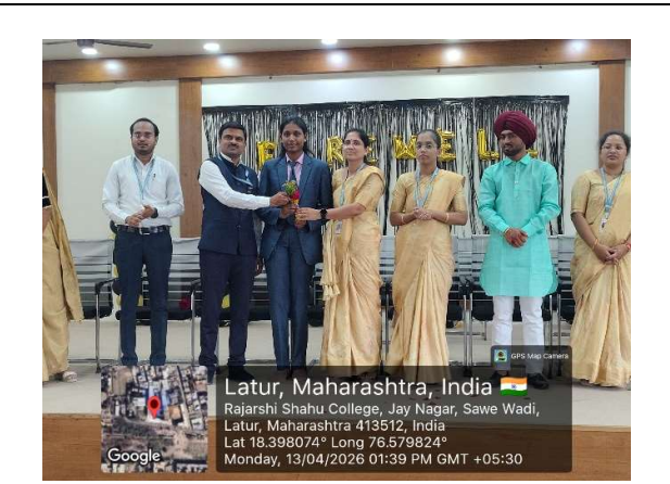
Faculty Members While Felicitating Students